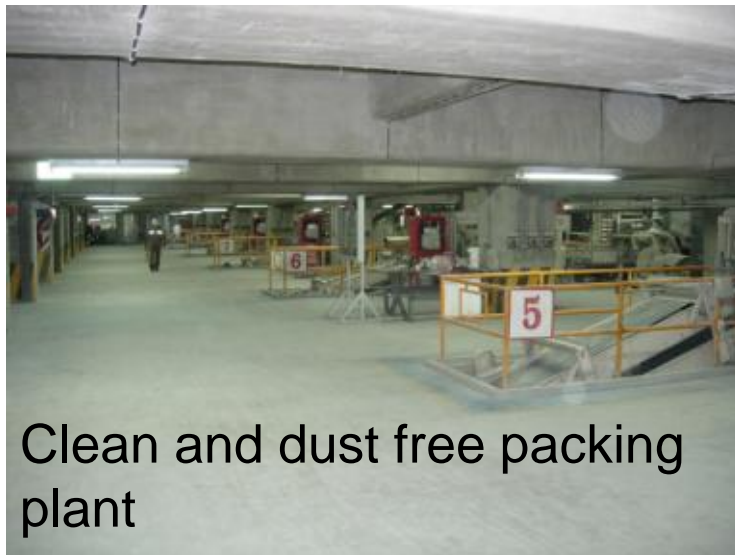
Clean and dust free packing plant