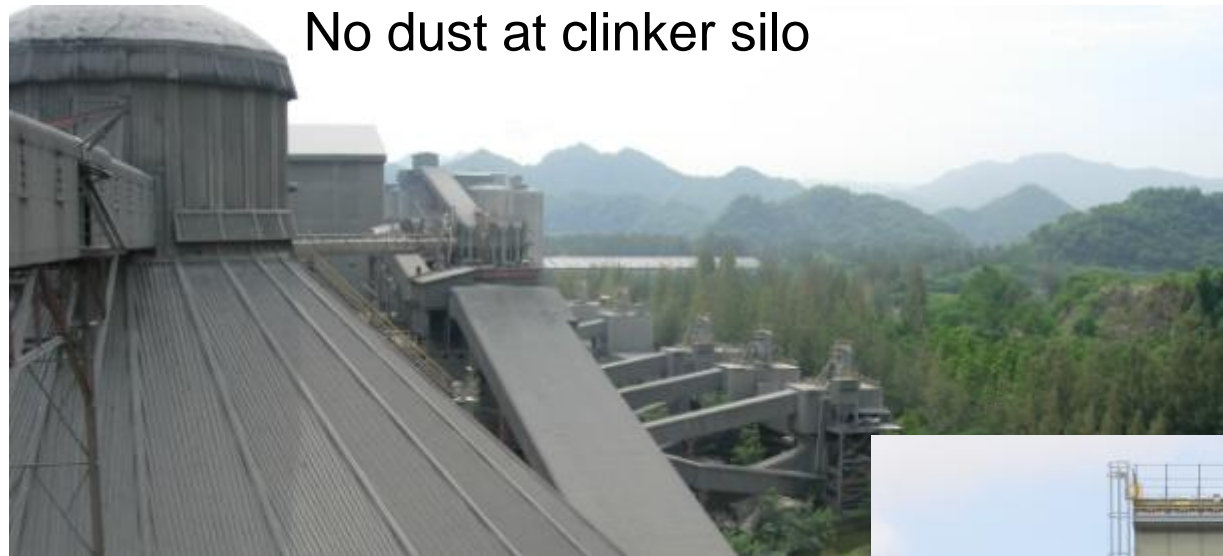
No dust at clinker silo